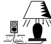
ON: Electric and magnetic fields.

A considerable amount of research has been done to determine whether electric and magnetic fields (EMF) from power lines adversely affect the health of those living near the lines. The research findings have been inconclusive; there is no direct cause-and-effect link between EMF and any illness.