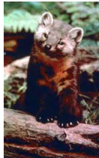
The American Marten

The American Marten, a member of the weasel family, is a state endangered species found in the northern forests of Wisconsin. Due to the Marten's small population size found in Wisconsin, inbreeding has led to a lack of genetic diversity. In response to this, the Wisconsin Department of Natural Resources' Bureau of Endangered Resources has implemented a project to introduce martens from populations outside the state to help increase genetic diversity. Money provided by the ATC Environmental Stewardship fund has helped with this effort to bring new genetic stock of the endangered martens to the reintroduction sites in northern Wisconsin.